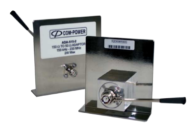
ADA-515-2 Adapter (Front and back view)